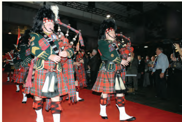
The opening ceremonies included the 48th Highlanders of Canada Pipes and Drums presenting the Canadian flag to the Convention