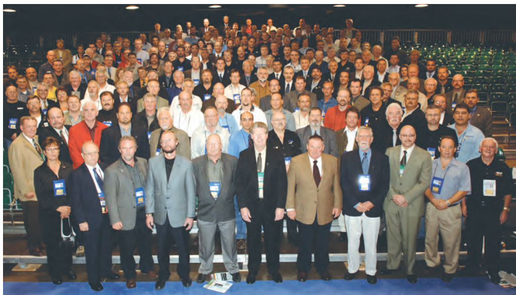
Pictured above are the Canadian delegates who attended the International Convention in Cleveland, Ohio.