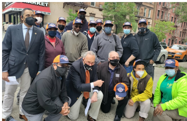
New York Sen. Chuck Schumer, kneeling, second from left, promoted electric buses with Local 3 members in Manhattan.

With a public event at the Tuskegee Airmen Bus Depot in Manhattan featuring New York Local 3 members, Senate Majority Leader Charles Schumer announced new legislation on May 4 that targets $73 billion to electrify the nation's mass transit bus fleet.