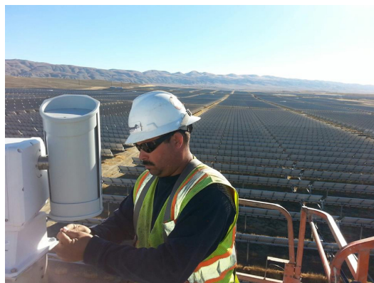
The IBEW and the Biden administration aim to improve the quality of jobs in the renewable energy industry.