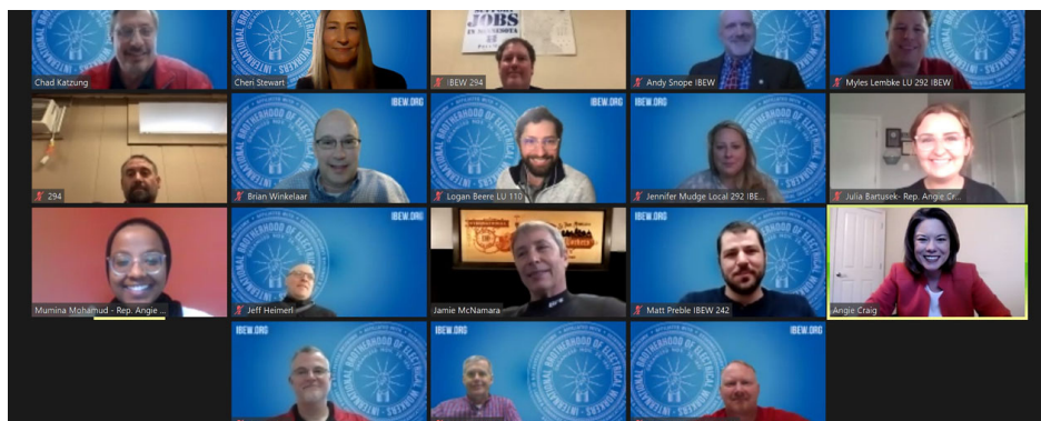
Many participating IBEW members downloaded the popular blue IBEW Zoom screen.