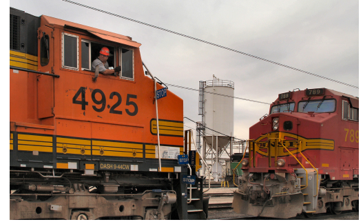
The IBEW is seeking to protect strong labor standards in the railroad industry.

"Congress must ensure that we continue to create good paying jobs by upholding hard-fought labor protections that have been in place for almost a century by designating providers as rail carriers with a workforce covered under railroad labor laws, ensuring that contractors will compete for work based on who can best train, equip and manage a construction crew by requiring prevailing wages, upholding Buy America standards, establishing strong regulatory regimes and safety cultures in new operations and technology and fostering innovative strategies to deliver economic benefits to local communities," Eckert said .