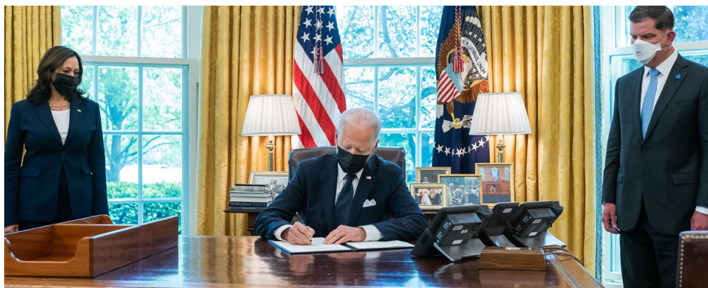
Flanked by Vice President Kamala Harris and Labor Secretary Marty Walsh, President Joe Biden signs an executive order Monday creating the historic White House Task Force on Worker Organizing and Empowerment. They have 180 days to recommend ways the government can foster union growth, as prescribed by federal labor law that has been ignored for decades.

A new high-level White House task force is charged with making sure the federal government acts to promote unions and collective bargaining.