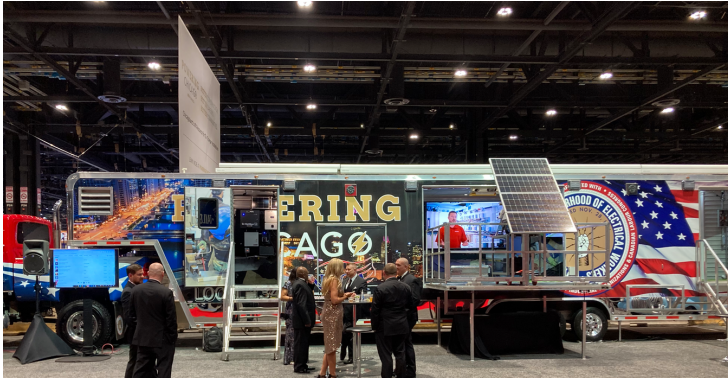
EVITP-credentialed members will help build out the nation's electric vehicle charging network. IBEW training includes EVITP, which is also a short course available to journey-level members.

"Once we get shovels in the ground to put these chargers up, it is going to mean jobs, jobs, jobs and more jobs," said Energy Secretary Jennifer Granholm. "The jobs that are good-paying union jobs all over the country, in every pocket of this country, and the training that goes with [them] is a huge opportunity for communities."