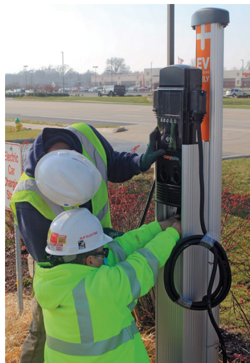
The Biden administration's high-level task force is actively instituting policies to support unionizing and collective bargaining.

Click here to read an in-depth Electrical Worker article on the work of the task force.