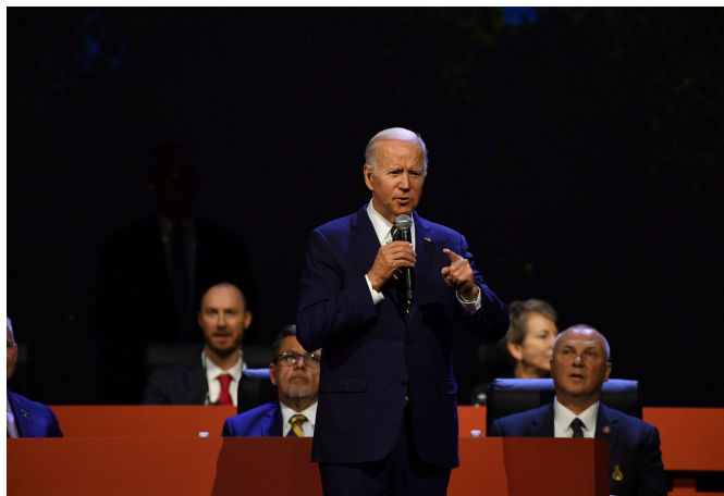
Joe Biden became the first sitting president to address an IBEW convention on May 11. "The only reason I'm standing here now as president of the United States is because the IBEW came on with me early," he said.

"The only reason I'm standing here now as president of the United States is because the IBEW came on with me early," Biden said as he arrived on stage at the 40th International Convention to a raucous standing ovation — somehow possible even with every other hand appearing to hold a camera phone in the air.