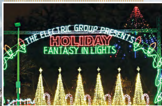
Below: In Madison, Wis., Olin Park's annual Holiday Fantasy in Lights, a drive-through display of animated light sculptures, wouldn't be possible without the labor and skilled tradecraft of Local 159 members and retirees.