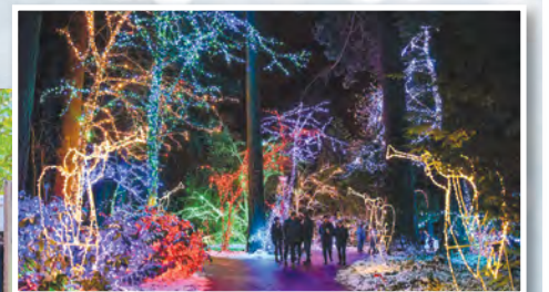
Above and left: Portland, Ore., Local 48 volunteers install wiring for more than 1 million LED lights that electrify a holiday festival (inset) at the Grotto, a Catholic shrine and botanical garden.