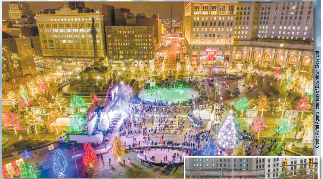
Above: Downtown Cleveland's Winterfest is a sparkling feast for the eyes during the holidays thanks to Local 38 volunteers. Inset: Some of the 100 members and retirees who turned out on an October Saturday to prepare the 2019 display.