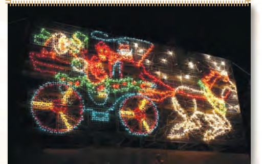
Below: The Lions Festival of Lights in Calgary, Alberta, wouldn't be possible without Local 254 volunteers (pictured in Enmax Energy bucket trucks) who string some 500,000 lights each holiday season.