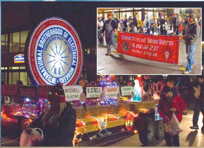
Sioux City, Iowa, Local 231 took over its town's beloved holiday parade and tree-lighting ceremony in 2011 after it lost its sponsor a year earlier.